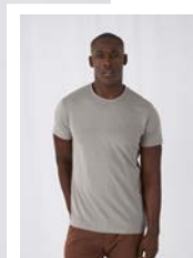
DUO CONCEPT with B&C Organic Inspire T /men