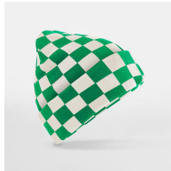
Kelly Green/ Off White