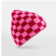
Classic Red/ True Pink